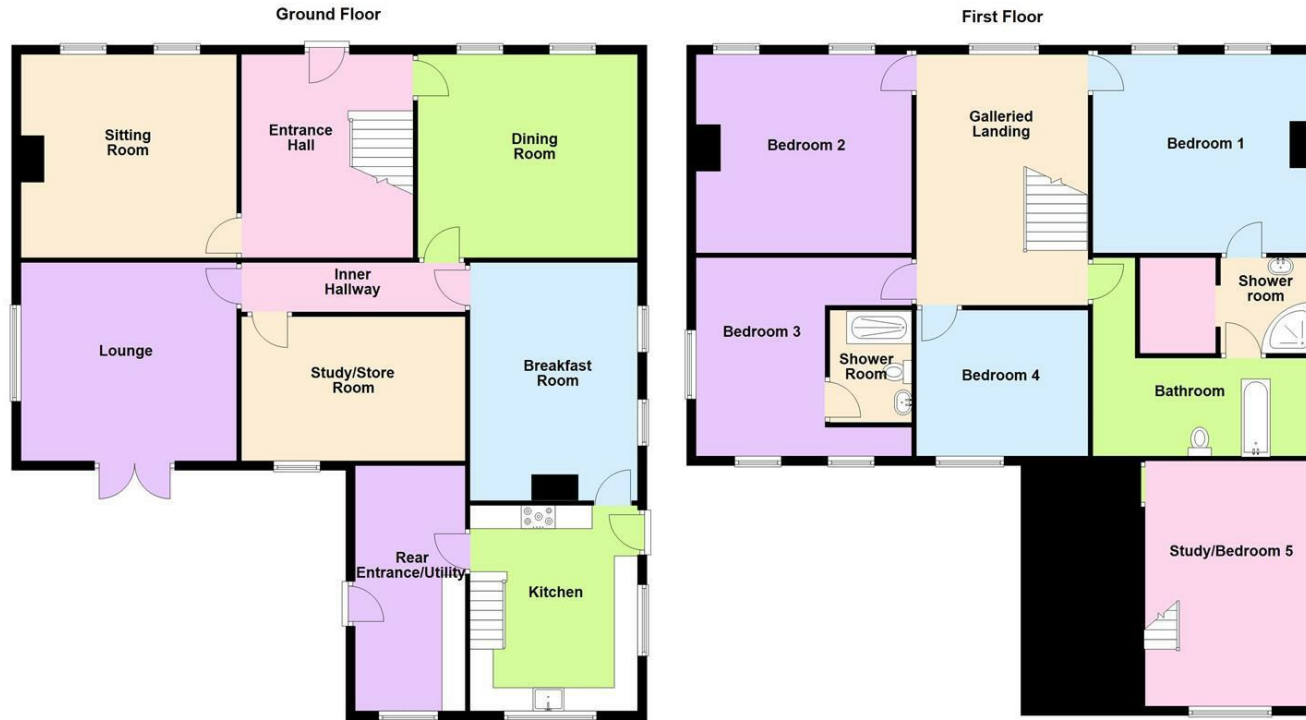
The Elms, Hull Road, Skirlaugh